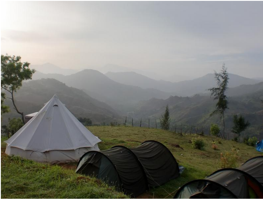
Our first 'home' – in tents, in a convent/orphanage in the mountains.