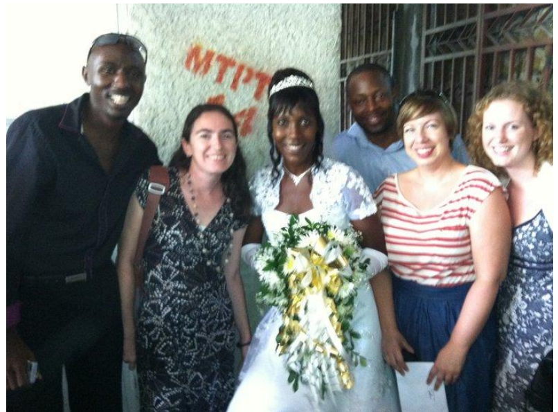
Happy memories of the weddings of our staff