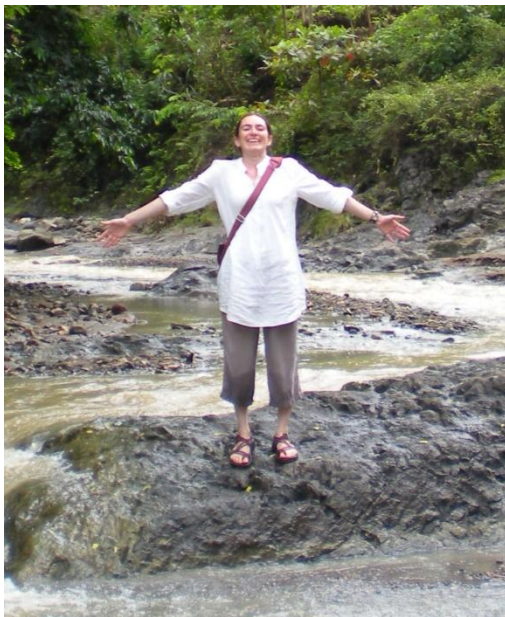
Visiting field sites often meant wading through rivers ,or walking up and down mountains!