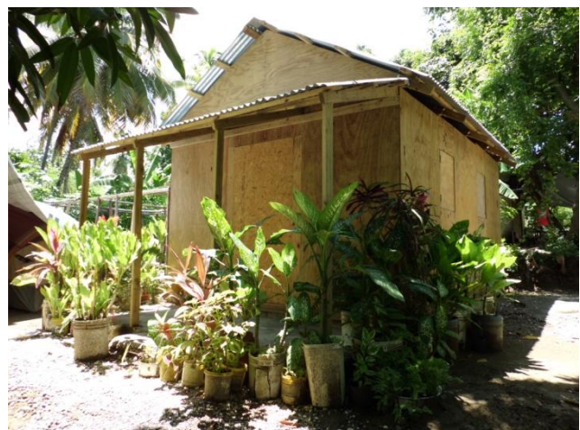
I love this photo of one of our shelters – the family planted a luscious garden outside it!