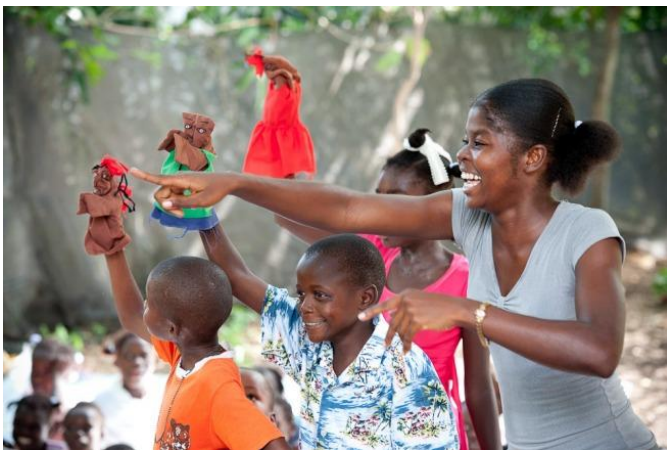
Teaching children at clubs, with puppets.