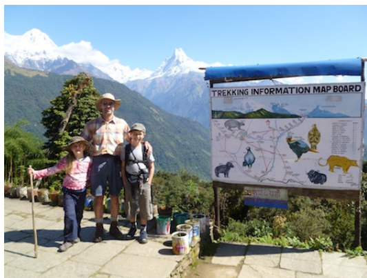
We all enjoyed escaping Kathmandu for a trek in October.

Please pray for a good translator and for the time and opportunities to use this manual well.